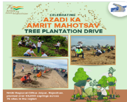
10 PM · Jul 15, 2022 · Twitter Web App

Under #AmritMahotsav, NHAJ Regional Office Jaipur planted more than 93,000 saplings in a single day across 75 sites in the state of Rajasthan. The nationwide tree plantation drive was organized by NHAJ to promote environment sustainability.