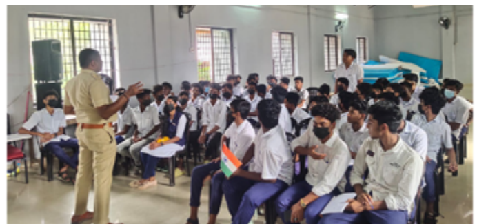
Celebrating Amrit Mahotsav, NHAI Project Implementation Unit Palakkad organia Road Safety Awareness program with students at VHSS School, Kanjikode. Office from Regional Transport Office (RTO) were also present on the occasion.