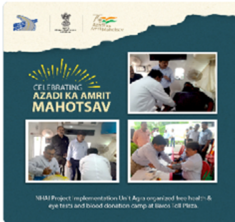
4:44 PM · Jul 20, 2022 · Twitter Web App

Under #AmritMahotsav, NHAJ Project Implementation Unit Agra organized a blood donation camp, and free eye & health tests at Baros Toll Plaza. Essential medicines were also distributed free of cost to beneficiaries present at the camp.