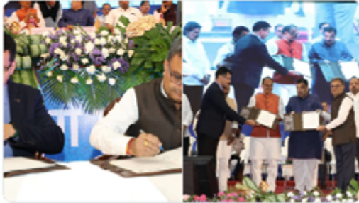
8:24 PM · Aug 2, 2022 · Twitter Web App

National Highways Logistics Management Limited a 100% owned SPV of NHAJ and MP PWD signed an MoU on Ropeway Projects for alternative mobility solutions in the State of Madhya Pradesh. The state Govt. has submitted the list of 14 projects to be taken up for Ropeway Development.