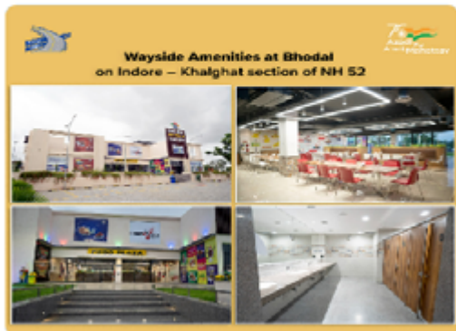
10:37 PM · Aug 2, 2022 · Twitter Web App

Hon'ble Minister for RTH, Shri @nitin_gadkari in presence of Shri @ChouhanShivraj, Hon'ble Chief Minister of Madhya Pradesh inaugurated wayside Amenities on the Indore – Khalghat section of NH 52. Restrooms, Food Plaza, and Medical facilities are available for Highway users.