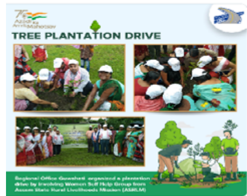
5 PM · Jul 17, 2022 · Twitter Web App

celebrating #AmritMahotsav, Regional Office uwahati organized a plantation drive by involving women Self Help Group from Assam State Rural Livelihoods Mission (ASRLM) under the nationwide plantation initiative by #NHAJ. Here is a glimpse of the event.