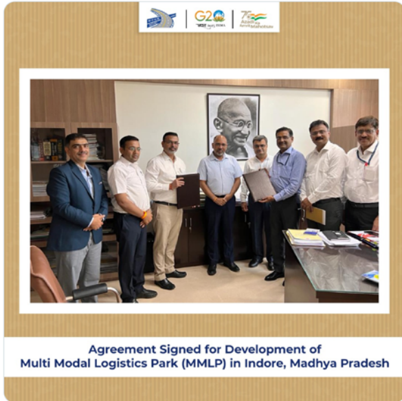
Agreement Signed for Development of Multi Modal Logistics Park (MMLP) in Indore, Madhya Pradesh

As envisioned under PM Gati Shakti, an agreement to develop Multi Modal Logistics Park in Indore, Madhya Pradesh has been inked b/w Indore MMLP Ltd. (SPV of National Highways Logistics Management Ltd.), Rail Vikas Nigam Ltd. & Madhya Pradesh Industrial Development Corporation.