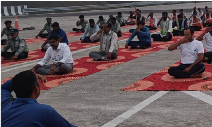
NHAI Project Implementation Unit Ratlam, Madhya Pradesh