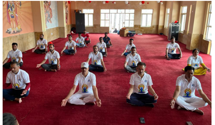
NHAI Regional Office, Shimla, Himachal Pradesh