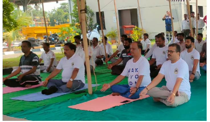
NHAI Project Implementation Unit Behrampur, Odisha