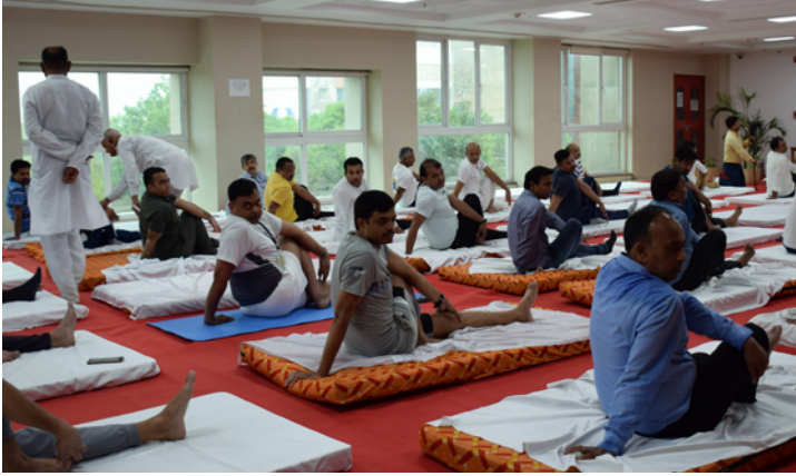
NHAI HEADQUARTERS, New Delhi

किया गया जिसमें अधिकारियों ने उत्साह के साथ भाग लिया और स्वस्थ जीवन में योग की महत्ता का प्रदर्शन किया।