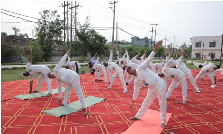
NHAI Regional Office, Jammu & Kashmir