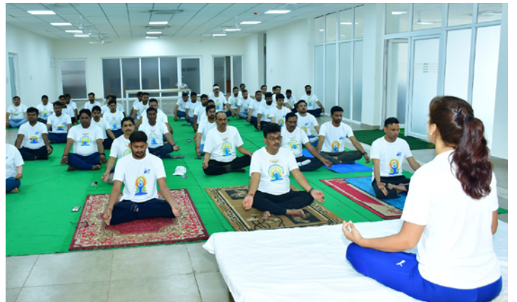
NHAI Project Implementation Unit Sohna, Haryana