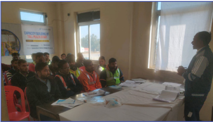
Jagatpur Patti, Uttarakhand