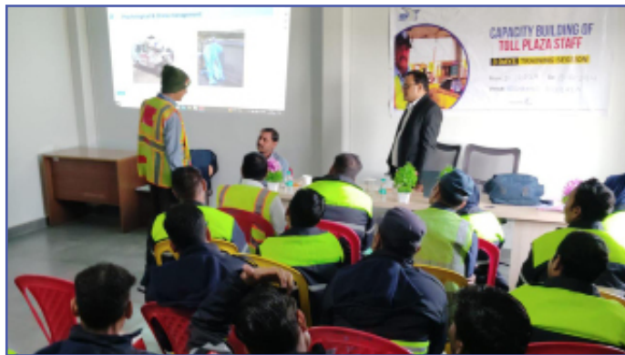
Bigha Khet, Uttar Pradesh