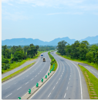
Creating Green Highways

Embarking on a continuous journey of building knowledge and fostering innovation, NHAJ undertook a series of capacity building initiatives for all its stakeholders that included its officers, staff, consultants and concessionaires. The exemplary initiative demonstrating NHAJ's commitment to achieve excellence in holistic development of National Highway infrastructure.