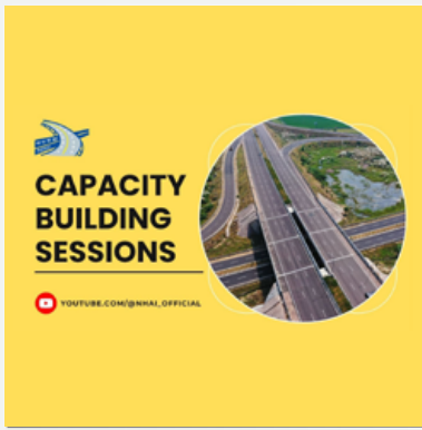
Capacity Building Initiatives

Embarking on a continuous journey of building knowledge and fostering innovation, NHAJ undertook a series of capacity building initiatives for all its stakeholders that included its officers, staff, consultants and concessionaires. The exemplary initiative demonstrating NHAJ's commitment to achieve excellence in holistic development of National Highway infrastructure.