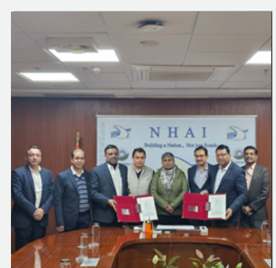
Collaborations for Nation Building

NHAJ took rapid steps in 2024 to provide barrier free travelling on National Highway through Global Navigation Satellite System (GNSS) based Electronic Toll Collection (ETC) in India. Poised to be the future of ETC in the country, the technology will not only enhance the travel experience of National Highway users but will also increase the efficiency of tolling operation in line with global practices.