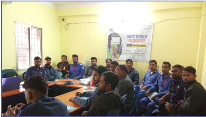
Baman Danga, West Bengal