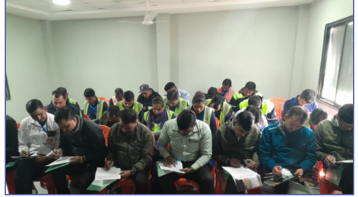
Babina, Uttar Pradesh