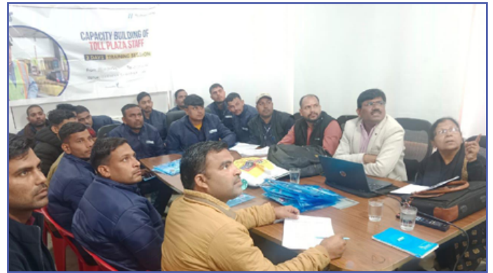
Faizabad, Uttar Pradesh