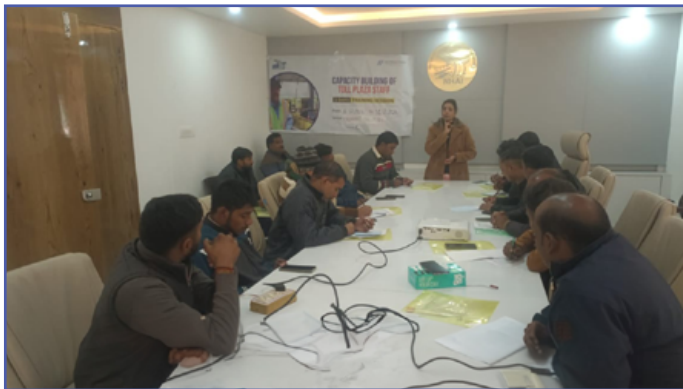
Pikhawan, Uttar Pradesh