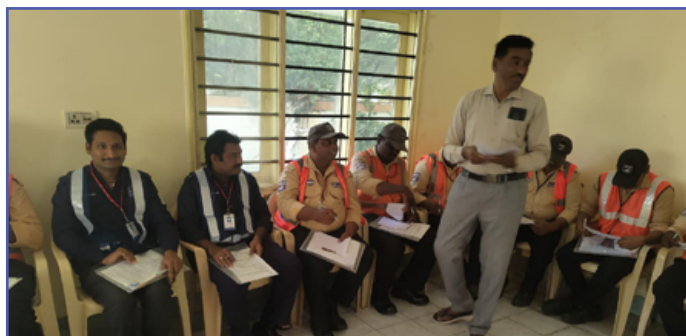
Keesara, Andhra Pradesh