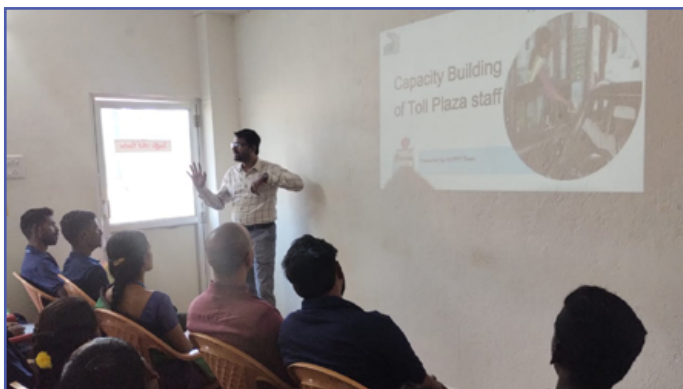
Madurai, Tamil Nadu