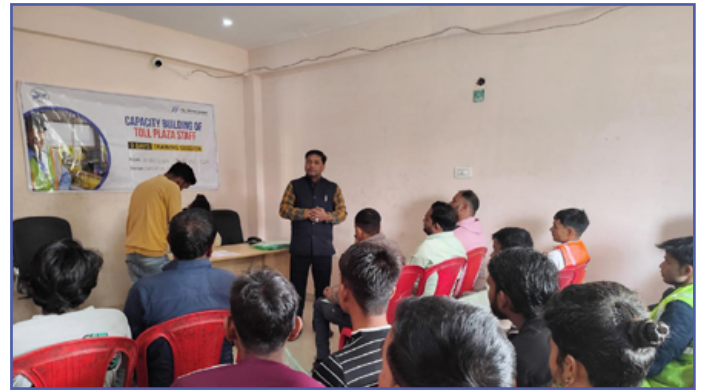
Jerh, Uttar Pradesh