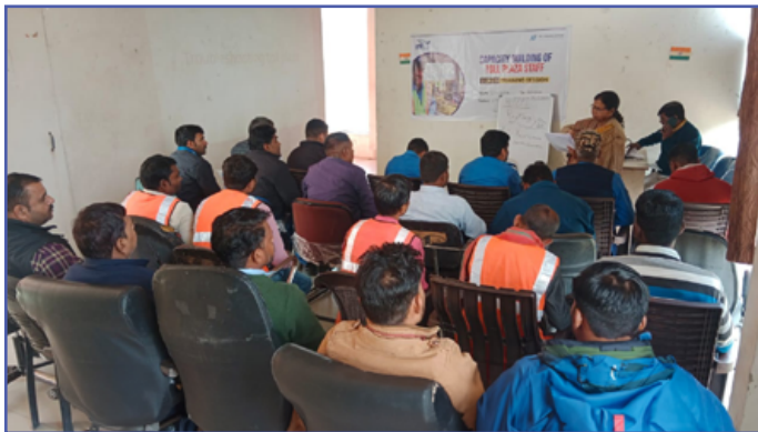
Karaundi, Uttar Pradesh