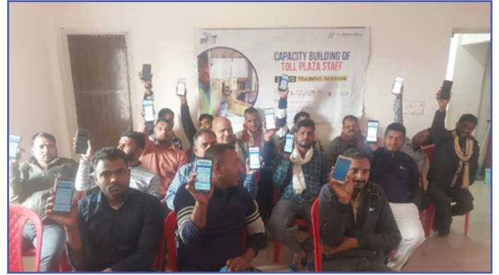
Gulal Saray, Uttar Pradesh