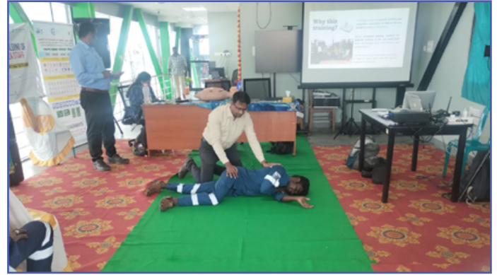
Etturvattam, Tamil Nadu