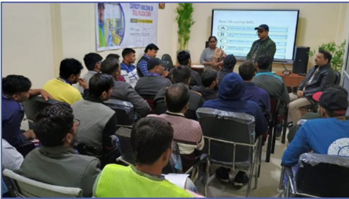
Kanpur, Uttar Pradesh